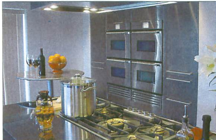
TMIO's Connect Io oven has received recognition from the Consumer Electronics Association for three consecutive years and was named among Time magazine's coolest inventions of 2003.